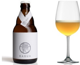
KAGUA BLANC 8% Alc/Vol

Refreshing Belgian-style ale with a flavor of Yuzu. Hint of malt & hop flavour, balanced bitters & a wheat-derived creamy taste. Full-bodied, elegant & smooth