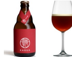
KAGUA ROUGE 9% Alc/Vol

Rich & full-bodied Belgian-style ale with flavours of roasted malt & spicy Sansho. Rosy dark copper color with a creamy head. Well-balanced, complex & refreshingly spicy.