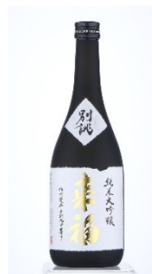
RAIFUKU BETSUATSUREA – Arr. May Junmai Daiginjo; 16% Alc/Vol Silver, IWC '22

Made with Aiyama rice polished to 29%, this is a silky melon sake with aromas of guava cherries, key lime pie, passion fruit with a pleasant lasting finish